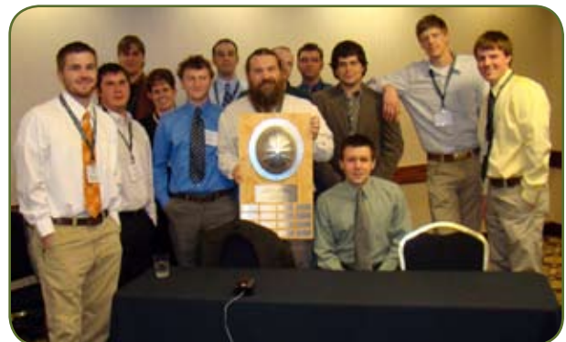
Congratulations to the UT Chapter who recently won the Quiz Bowl competition at the K-T SAF Winter Meeting

We would like to offer a heartfelt thanks to all the professional foresters, professors, and more who have supported the Club over the years.