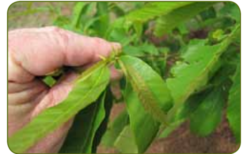
The Kentucky Division of Forestry is working with the American Chestnut Foundation to grow chestnuts.