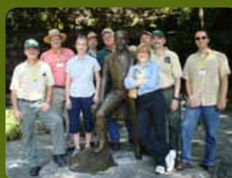
KTSAF contingency take a group shot with Jack Daniels.