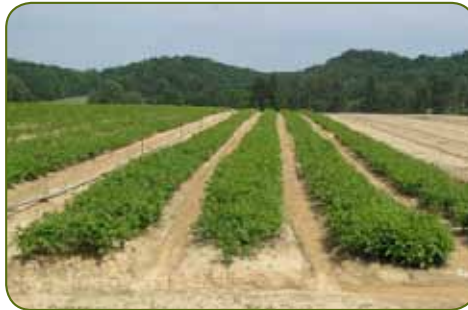
Kentucky Division of Forestry's Morgan County tree nursery